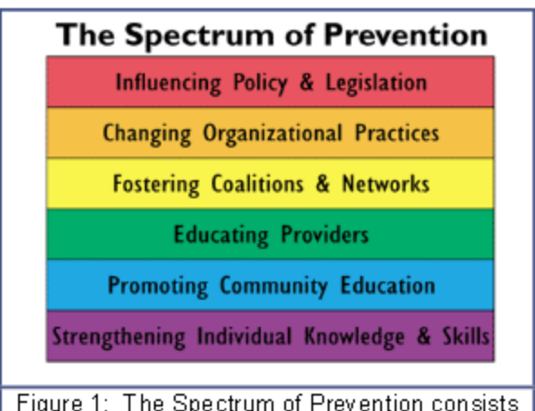
Figure 1: The Spectrum of Prevention consists of interventions at all levels of military society.

Beyond the amazing return of the scrapped DHS color coded chart for threat, there is one glaring omission.